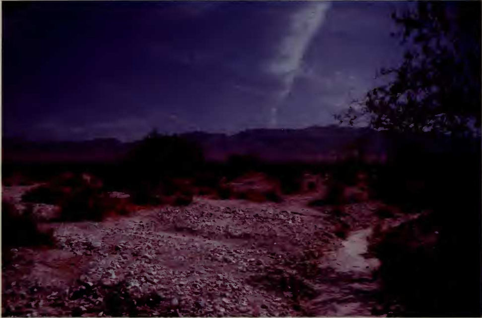
Fig. 1. Ironwood wash woodland near Palen Pass, Riverside County, California. Granite Mountains are in the background.

hillslopes (Figure 1). The Chuckwalla Valley ranges from 200–350 m at the base of the Granite Mountains.